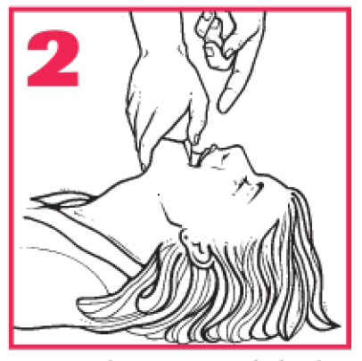
Open the airway and check the mouth for objects. Remove the obstructing object only if you see it.